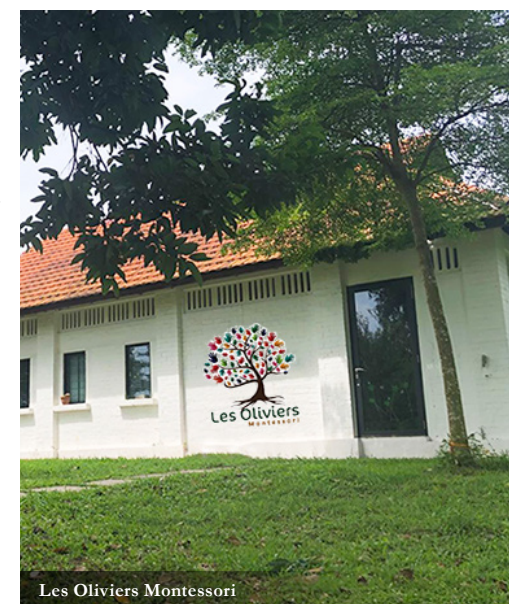
Les Oliviers Montessori

WHERE Blk 71 Loewen Road CONTACT 9145 3656 OPERATING HOURS Mon – Thu: 8.30am – 3.30pm Fri: 8.30am – 12.30pm TARGETED OPENING 3 September 2018