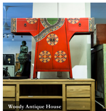
Woody Antique House

As the mid-year swings round, it's a prime opportunity to refresh your home with a new look for the second half of the year.