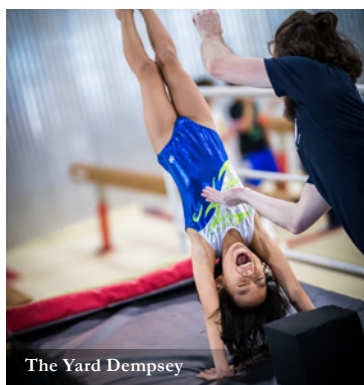
The Yard Dempsey

WHERE Blk 72 Loewen Road, #01-07, S(248848) CONTACT 6914 9660