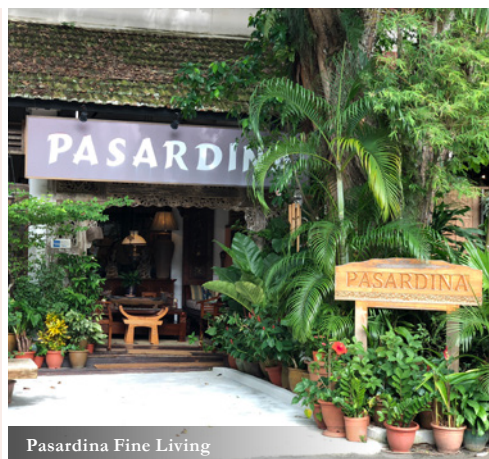
Pasardina Fine Living

WHERE Blk 13 Dempsey Road, S(249674) CONTACT 6472 0228