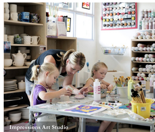
Impressions Art Studio

WHERE Blk 73 Loewen Road, #01-16, S(248843) CONTACT 8182 7635