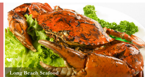
Long Beach Seafood

For seafood lovers, you don't want to miss the Black Pepper Crab at Long Beach Seafood . Created in 1982, the fragrant pepper sauce dish is a local classic and has been a popular choice among both local and tourists. If you prefer Chilli Crab, head to JUMBO Seafood instead, where you can enjoy the sweet and savoury crab dish with their Mantou, a crispy traditional Chinese bun.