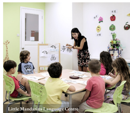
Little Mandarins Language Centre