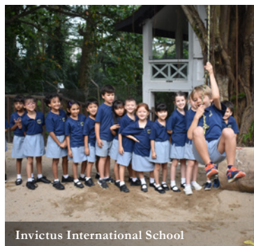
Invictus International School

WHERE Blk 73 Loewen Road, #01-21 S(248843) CONTACT 8338 6008