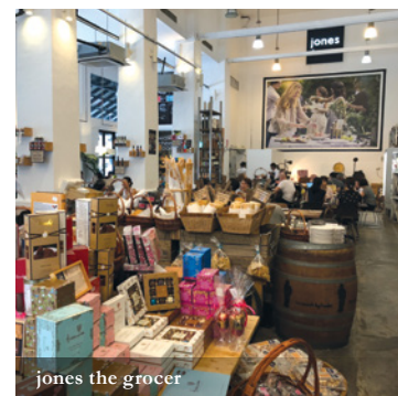
jones the grocer

WHERE Blk 26B Dempsey Road, S(247693) CONTACT 6479 0100